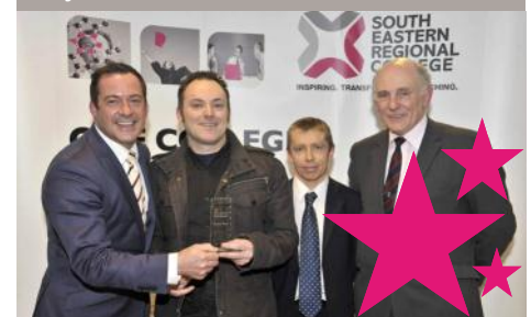
Student Placement Provider Award The Daily Grind - Downpatrick

On Wednesday 23 February students from Downpatrick and Newcastle were recognised at South Eastern Regional College's Excellence Awards. Almost forty awards were presented to students on a night that recognised excellence, commitment and dedication to education and personal development.